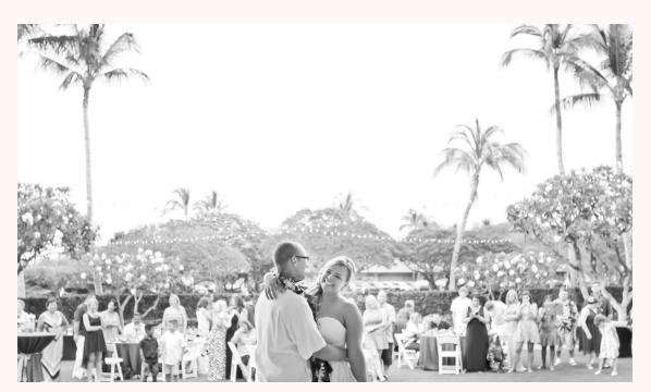
Hawaii Wedding Packages